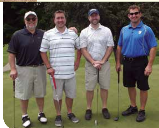
2014 Golf Outing – a Big Hit !! Please see page 2.