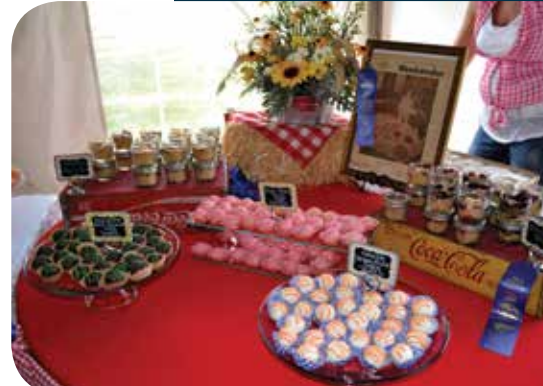
Blue-ribbon desserts: apple pies and truffles!

Plans are underway for next year's event. Stay tuned!