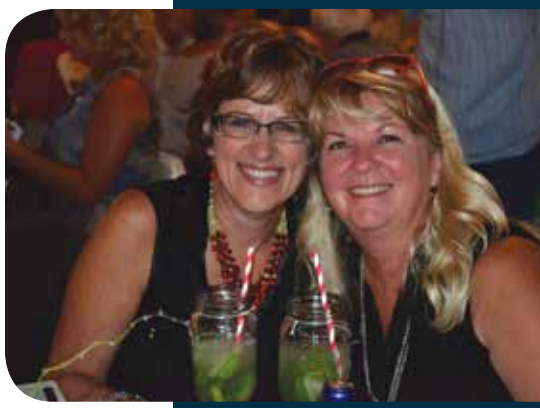
A Mojito drink tray was a specialty offering of the night.