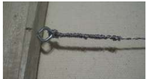
Screw Eyes with Braided Picture Hanging Wire