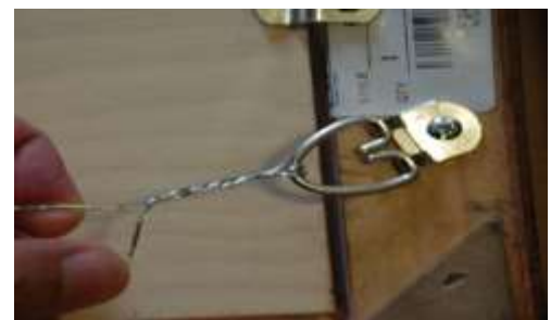
Strip Hangers with Braided Picture Hanging Wire