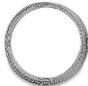
Hangers with Braided Picture Hanging Wire